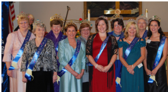
District Team "Stars" at District Annual Meeting