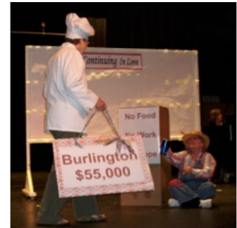
NC Conference Annual Meeting