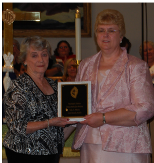
Center Receives Mason Award

Greetings in the Name of our Lord, Jesus Christ! Let us follow the kite as we "continue" with our Lord's mission in 2012. As we divide the bounty of which we have been made custodians with other less fortunate children, youth and women, we are always to give thanks to the one that has bestowed us this privilege. We had a wonderful year in 2011. We have satisfied our Pledge to Mission of $55,000 to the North Carolina Conference UMW. The Burlington District is the best and most loyal in their sharing and giving. As I have told you many times, I am so proud of your accomplishments!