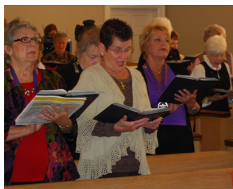
District Annual Meeting worship