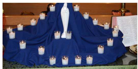
Candles in memory of UMW saints