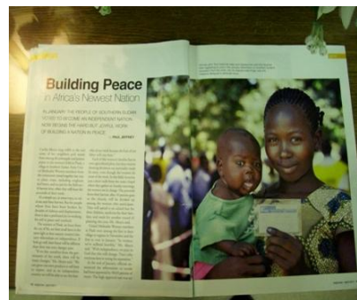
(Left) UMW participants in this year's Sudan Study II at Mount Hermon UMC bring mission to life as they read the book, They Poured Fire On Us From the Sky - The True Story of Three Lost Boys from Sudan .